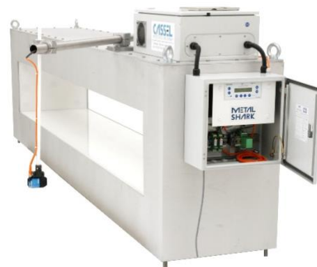
METAL SHARK BIG pba with Super Power Drive for more accurate metal detection plus belt seam detection to reduce false alarms