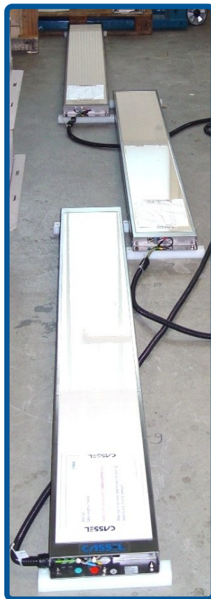
3 sensor segments

Typically, the METAL SHARK FL 3-ARRAY is used for inspection of textile-widths to detect smallest magnetic and non-magnetic metal particles. The metal detector is constructed as a 3-segment-sensor. The total detection zone of the detector is thus divided into 3 individual zones.