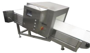
METAL SHARK® BD UltraSens provides a powerful boost to sensitivity