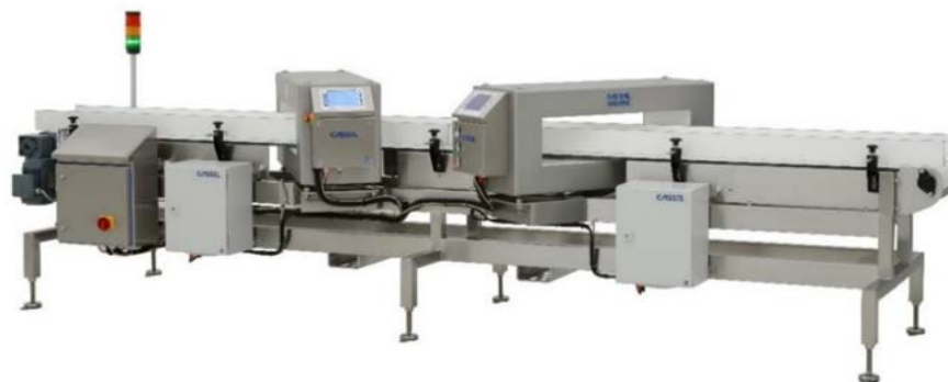
METAL SHARK® BD, Twinhead model with HQ conveyor