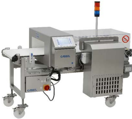
METAL SHARK BD with HQ conveyor