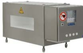
METAL SHARK® BD Ferrous in Foil detects magnetic metals in aluminum foil or trays