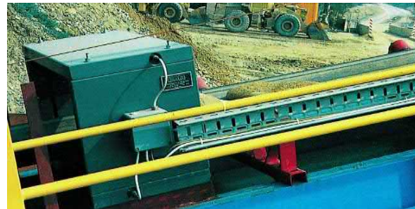
Metal detector SQTA – tandem version.

For a higher belt speed (M10 nuts) at a belt speed of max. 4.0 m/s we recommend the metal detectors SQ and SQTA.