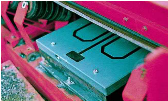
Metalldetektor SQ als Einzelsonde unter dem Förderband montiert.